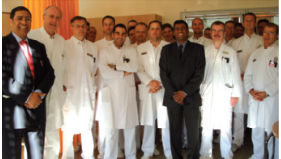
The team at the orthopaedic clinic at Krankenhaus Rummelsberg

We also saw Chefarzt Baur using his latest femoral stem implant called "Metaphyseal" that could be inserted through a small minimally invasive type incision. We also assisted in cases of high tibial osteo-