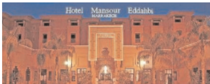
HOTEL MANSOUR EDDAHBI - The main conference hotel

The rates below are guaranteed until 30 May 2007!