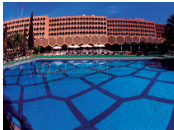
HOTEL ATLAS ASNI MARRAKECH

Double Occupancy (breakfast included): MAD 1,400 / EUR 126 Single Occupancy (breakfast included): MAD 1,090 / EUR 98