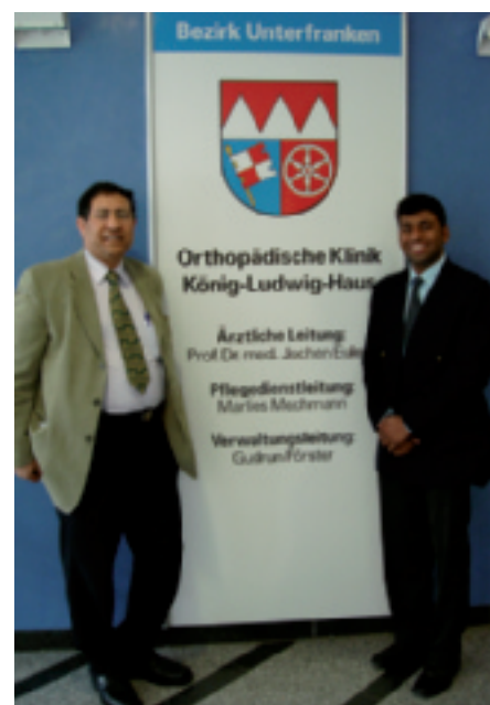
The two fellows at the Orthopädische Klinik König-Ludwig-Haus of the University of Würzburg