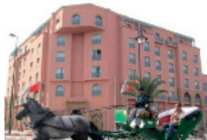
HOTEL RYAD MOGADOR OPERA

Hotel Ryad Mogador Opera is situated on one of the most prestigious avenues in the heart of Marrakech. From the rooms at the Mogador you will have a spectacular view of the majestic Atlas Mountains. The hotel is located in close proximity to the Gueliz commercial district and the historical medina. Hotel Ryad Mogador Opera does not serve alcohol.