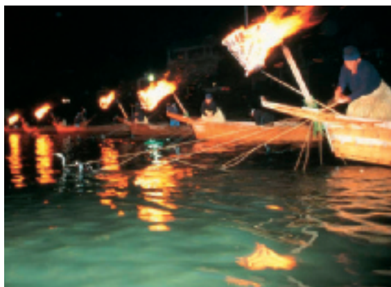
Cormorant fishing on the Nagara River

There are words like “Wakonyousai”, which means Japanese spirit with Western learning, representing an acceptance and harmonisation. It is the idea of developing Western technology while still valuing Japanese traditions from ancient times. Departments of orthopaedic surgery in Japan are characterised by many unique aspects even those under Western influence. Generally, the Japanese people prefer conservative treatment rather than surgical treatment and tend to prefer biological surgery and self-recovery rather than artificial implants and allotransplantation. As a result, out of the around 20,000 members of JOA, about 5,000 private practitioners deal only with diagnosis and conservative treatment.