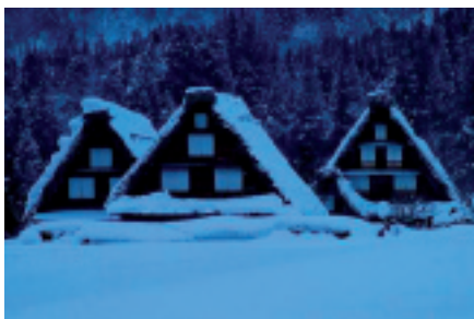
The World Heritage, Shirakawa-go, in Gifu