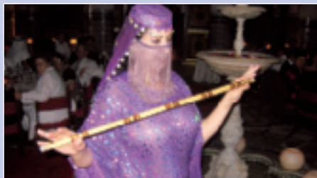
Dancer at the National Delegates' Banquet