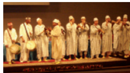
Andalusian music was followed by Daqqa fanfare

My country is not a founder of SICOT, but today everyone is a part