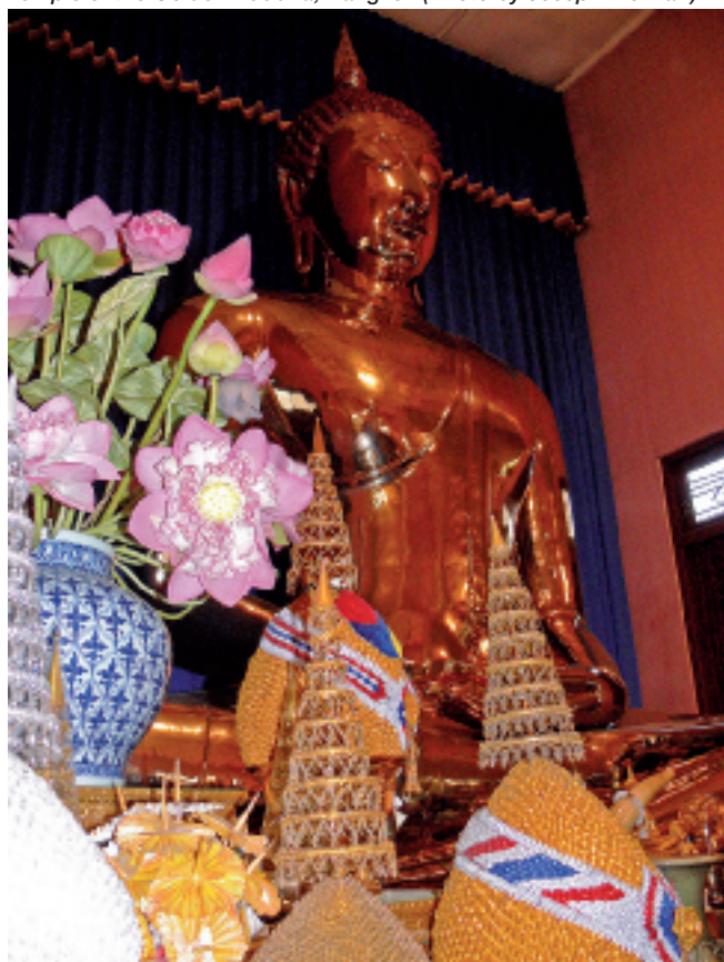
Temple of the Golden Buddha, Bangkok

The Sala Thai (Thai pavilion) is the country's architectural symbol and represents the skills of Thai craftsmen. Chang Thai (Thai elephant or Elephas maximus ) is a symbol historically and traditionally associated with Thailand. The national plant is the Rachaphruek ( Cassia fistula Linn.), known in English as the Piper Tree or Indian Laburnum.