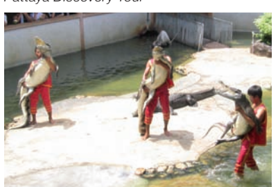
Pattaya Crocodile Farm