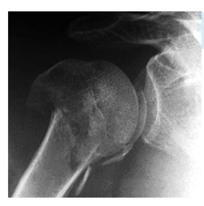
To find out the answer and to see further comments, please go to the SICOT website: http://www.sicot.org/?id_page=173

A 52-year-old male carpenter sustained a fall and presented himself with a painful shoulder.