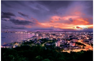
Pattaya by night