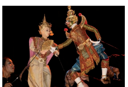
Thai puppet show, one of the most popular shows in Bangkok