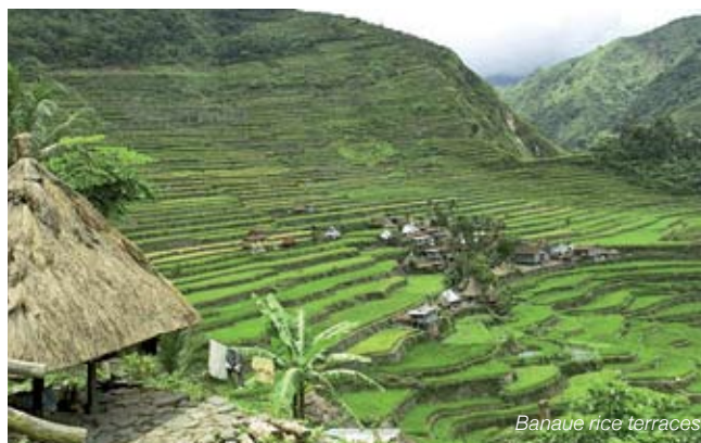
Banaue rice terraces