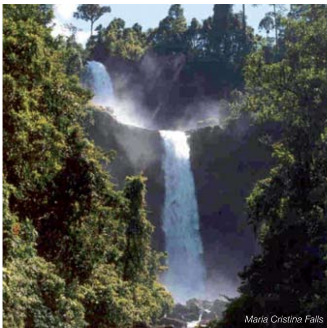
Maria Cristina Falls