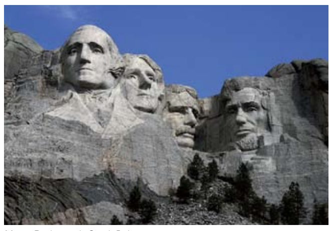
Mount Rushmore in South Dakota

The AOA played a critical role in the development of orthopaedics' largest society today, the American Academy of Orthopaedic Surgery (AAOS). The AAOS originated in 1933 as a non-profit organization based out of Northwestern University in Chicago, Illinois. With the advent of arthroscopic technique and joint replacement, orthopaedics as a specialty flourished. Since its inception, the Academy has grown to include 34,000 surgeons in over 100 countries. AAOS may have undergone significant change since 1933, but its mission has remained the same: to champion the interests of patients and advance the highest quality of musculoskeletal health.<sup>4</sup>