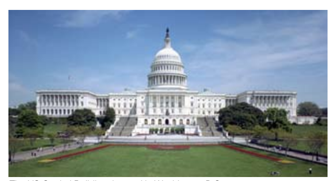
The US Capitol Building, located in Washington D.C. (Architect of the Capitol. Digital Image. <a href="https://www.aoc.gov/cc/photo-gallery/capitol-views.cfm">www.aoc.gov/cc/photo-gallery/capitol-views.cfm</a>. 1 November 2010)