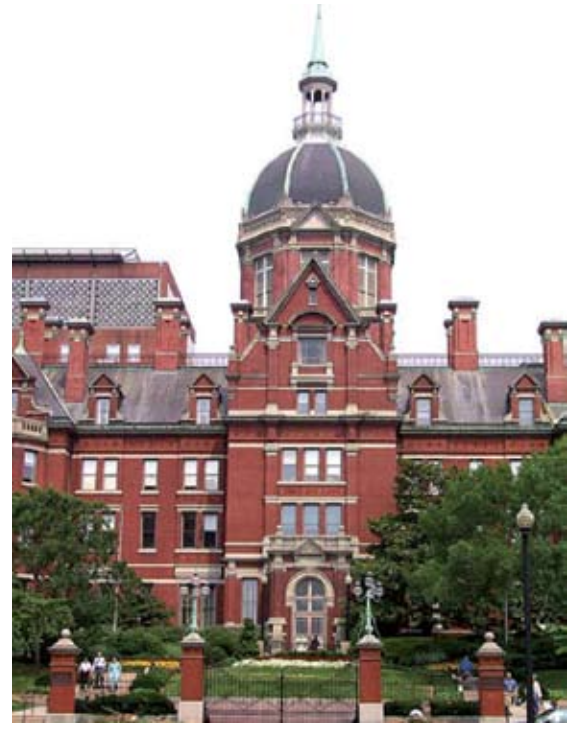
The dome of Johns Hopkins Hospital

This is a one-year research position which involves observation and clinical research. The applicant would spend the week in observing clinic, surgery and conferences. Every researcher is expected to write several papers for publication. This fellowship exposes you to a wide variety of clinical experiences, but a majority of the exposure will be shoulder problems, open and arthroscopic surgical techniques are utilized. A wide variety of shoulder problems including, rotator cuff disease, arthroplasty, SLAP lesions, and other soft tissue problems are encountered. Some research projects can involve basic science, including dissections and cell biology. A second year in the laboratory is available for qualified applicants.