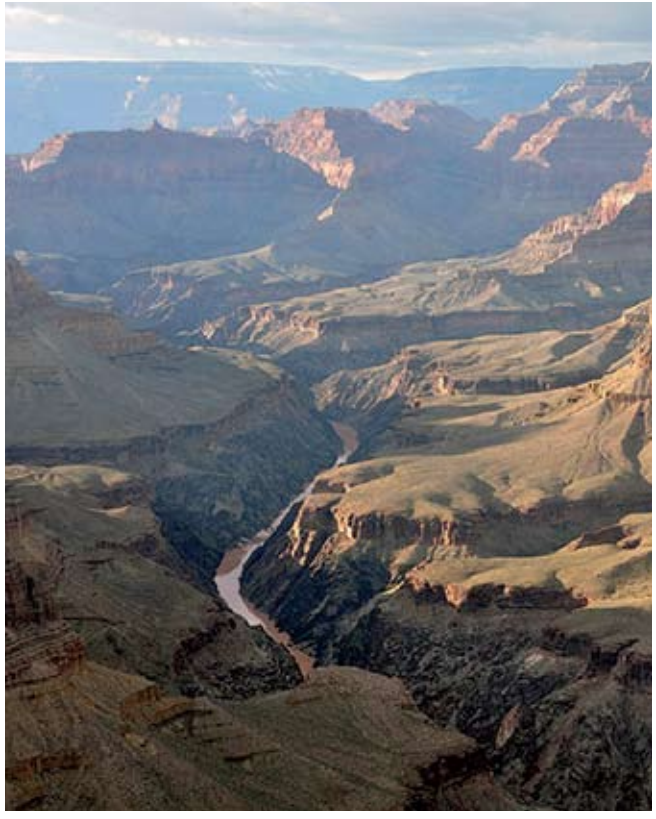
The Grand Canyon, located in Arizona Chensiyuan. Grand canyon hermits rest 2010. Digital image. Wikimedia Foundation. 16 March 2010. <a href="https://en.wikipedia.org/wiki/File:Grand">https://en.wikipedia.org/wiki/File:Grand</a> canyon hermits rest 2010.JPG. (This image is licensed under the GNU Free Documentation License)

The United States of America, situated between Canada to the North and Mexico to the South, is comprised of 50 states and spans an area of 9,826,675 km². The population consists of a wide variety of cultures, ethnicities, and religions, making the United States one of the most diverse countries in the world. A 2010 estimate approximates 310 million current residents. While our country does not have an official language, English predominates. The United States also has much in the way of geographic variety, hosting a wide range of terrains from mountains and valleys to deserts, rivers, and lakes. Ecologically, we are home to 17,000 species of vascular plants, 91,000 species of insects, and a wide variety of mammals, birds, and reptiles. Climate varies depending on region and time of year.¹