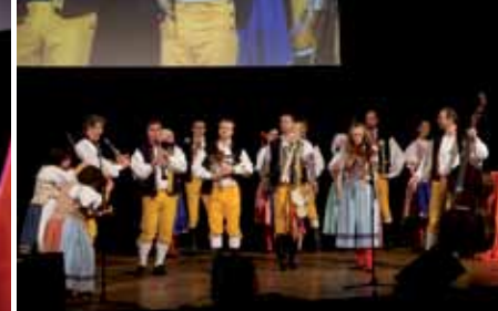
Folk dance group, Špalíček