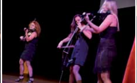
Violin trio, Inflagranti