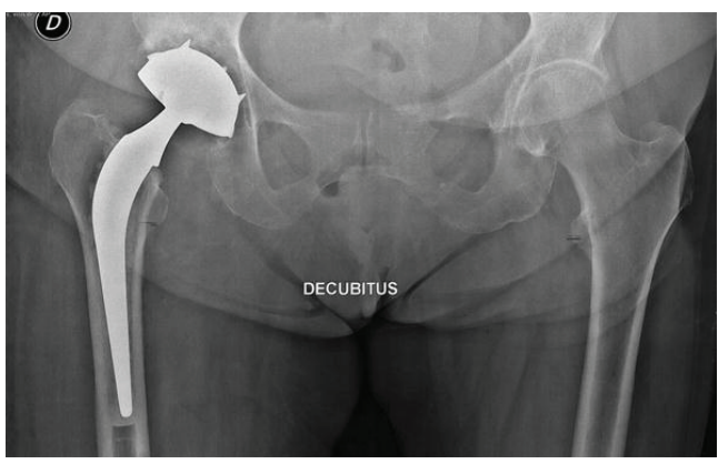
Figure 2: X-ray of HA cementless dual mobility cup

Figure 1B: X-ray of Charnley STALLION ^{\otimes} with cemented cup (right)