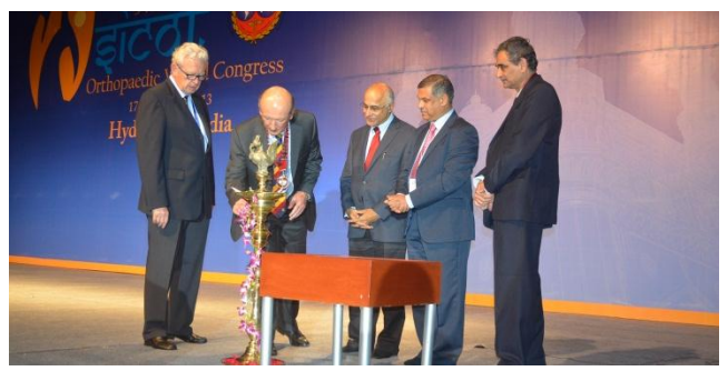
Traditional Indian lamp lighting to open the Congress

The theme of the Congress was Orthopaedics in an Unequal World and sessions were organised to get more interaction and create guidelines to bridge the gap between the developed and developing world. The highlight of the 34<sup>th</sup> SICOT Orthopaedic World Congress were the record-breaking 2,500 scientific abstracts, 240 eminent speakers, 47 symposia, 46 free paper sessions and one best paper session, and 11 focused oral presentation sessions, besides other interesting courses and social events like the Indian Night Party, Charity Run, Cricket Match and a variety of interesting tour options. A large comprehensive exhibition was held during the SICOT OWC. Participants witnessed the newest gadgets and cutting-edge technology that was being showcased by leading international and Indian companies. The SICOT India team sincerely thanks everyone who participated in the 34<sup>th</sup> SICOT Orthopaedic World Congress making it a landmark event in the history of Indian Orthopaedics.