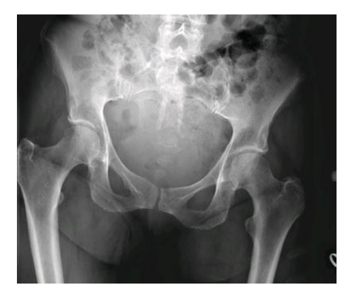
Q. What are your thoughts on the radiograph?

The plain radiograph of the pelvis was reported as normal.