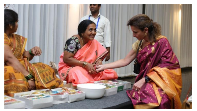
Indian Night Party