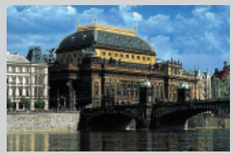
National Theatre of Prague