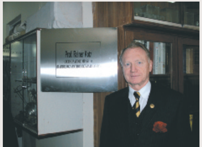
The Orthopaedic Museum at the SICOT Education Centre named after Prof Dr Rainer Kotz