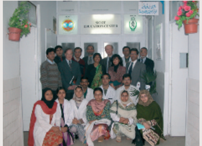
The team of the Mayo Hospital Orthopaedic Surgery Department in front of the entrance to the SICOT Education Centre