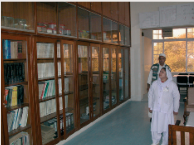
The library of the SICOT Education Centre