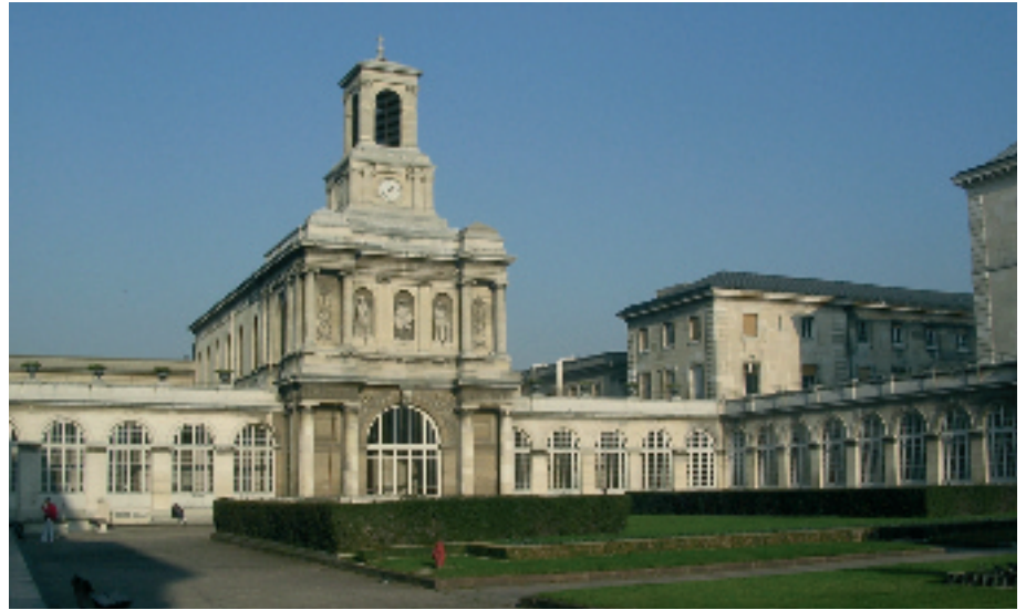
Lariboisière Hospital, Paris

The health system consists of high-level quality care for everybody and this is almost free of charge. Health care cost in France represents nearly 9% of the gross national product. Patients with serious illnesses