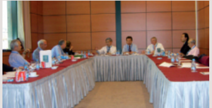
IFPOS Board meeting during SICOT/SIROT 2005 Triennial World Congress in Istanbul