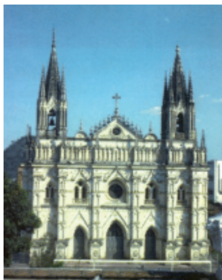
Cathedral of Santa Ana