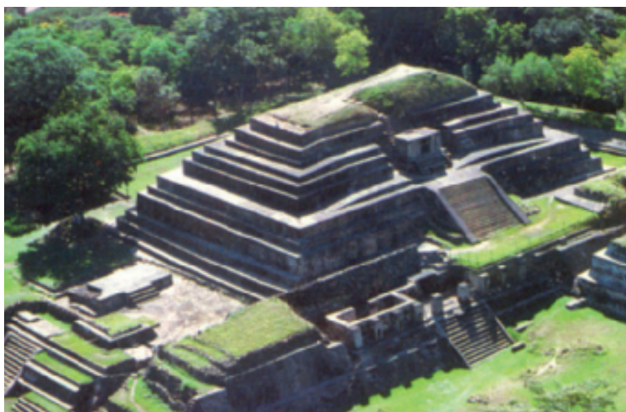
Ruins of Tazumal, department of Santa Ana